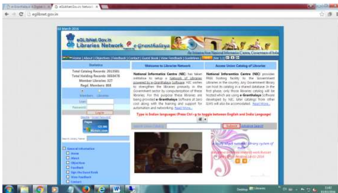
Fig.5: Union Catalog of Indian libraries home page