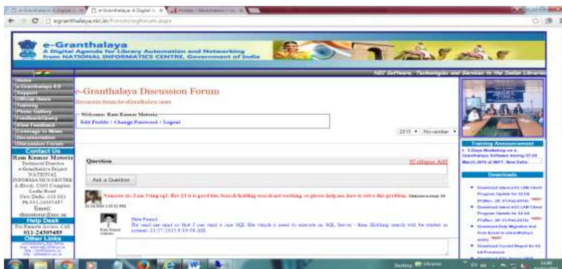
Fig.4 : e-Granthalaya Discussion Forum

During 2013, we have launched 'e-Granthalaya Discussion Forum' for submitting users queries online where any other user can provide answer/solution to the problem. Earlier all the users were sending queries to us only – it has minimized requirements of support from e-Granthalaya Team upto 50%. During the year 2015 – over 200 Queries were submitted by the users with multiple answers from many of the users themselves.