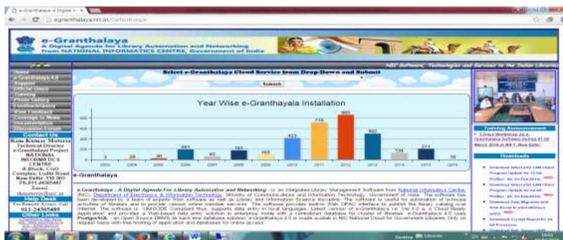
Fig.1: e-Granthalaya Home Page

During 2015, e-Granthalaya Web site was improved, added many of the new features for Users like Dashboard etc. Users can submit their queries, etc using the Feedback Form in the Web Site. Photo Gallery and few more web pages were added in the site. News published on e-Granthalaya were also uploaded at this web site.