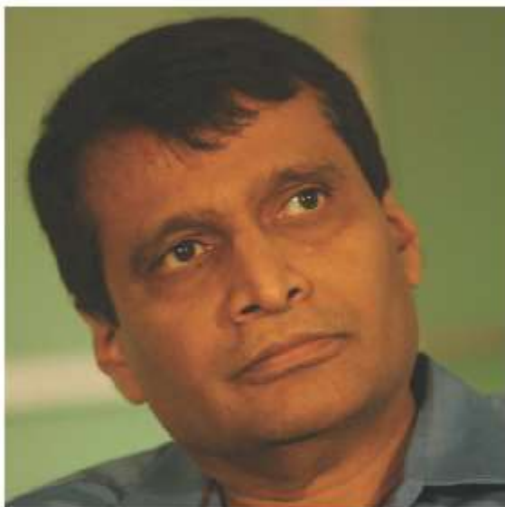
Railway Minister Suresh Prabhu dna Research & Archives

It has e-access to existing libraries of Railways, and all the libraries are being clustered to have a single interface through e-Granthalaya by NIC.