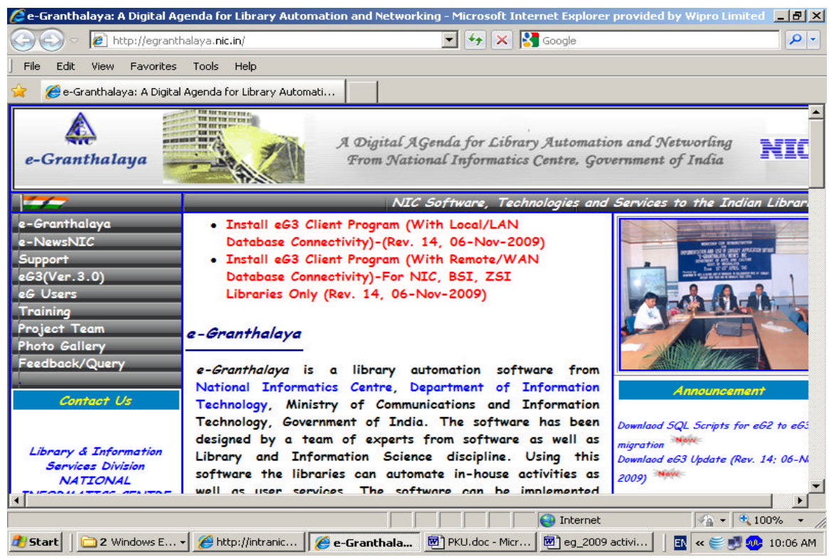
Fig.1: e-Granthalaya Home Page

During 2009, e-Granthalaya Web site was improved, added many of the new features for Users. Users can submit their queries, etc using the Feedback Form in the Web Site. Also, users can install the e-Granthalaya Software direct from our web site.