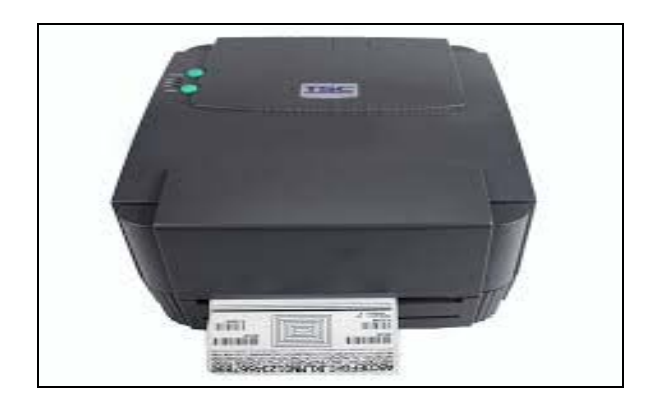
Illustration 3: Bar code machine

Bar code labels are printed on self adhesive labels. The system generates two labels for each book to be pasted on the front cover page and second paste last page with laminated with cello tape. For bar coding side by side, new books processed by the technical processing section were also bar coded before release.