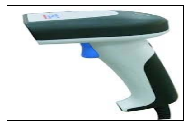
Illustration 4: Bar code Scanner

Central library operate a hand-held bar code scanner (TSC Model no. HCS-200) for scanning the bar code of Books. It is optical system 2048 pixels CCD and multi-interface based on HCS-200-U: USB.