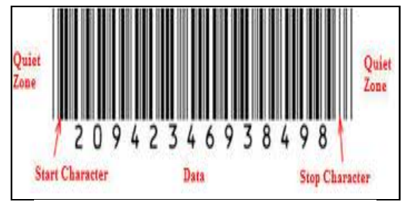
Illustration 2: general bar code arrangement

A bar code is a machine readable code consisting of a series of bars and spaces printed in defined ratios. Bar code symbologies are essentially alphabets in which different widths of bars and spaces are combined to form characters and ultimately a message. [3]