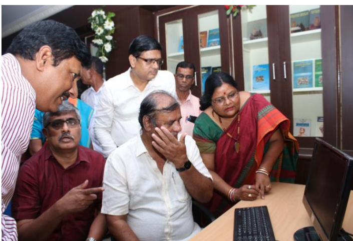
Dignitaries Exploring various features of e-Library